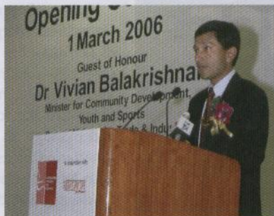
Guest of Honour, Dr Vivian Balakrishnan speaking at IFFS2006.

With more than 32,000 pieces of furniture and furnishing products featured, it had the largest collection of quality products in the Asean region.