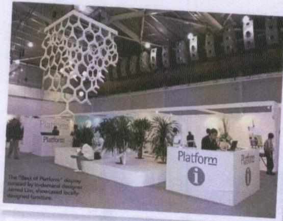
The "Best of Platform" display curated by Indonesian designer Jared Lim, showcased locally designed furniture.

text CHIQUIT TORRENTE