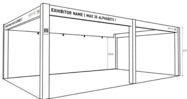
For IFFS / AFS Shell Scheme (Furniture Section)

* Additional column(s) will be added to support Fascia length of more than 6m & above).