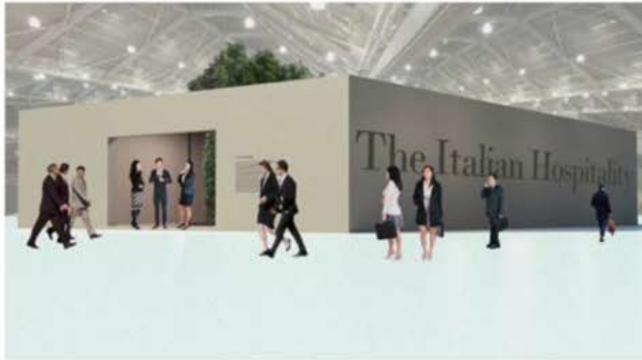
• "THE ITALIAN HOSPITALITY" - 200 MQ - BUSINESS AND VIP LOUNGE

"THE ITALIAN HOSPITALITY" is a project created with the aim of encouraging European companies to leverage on IFFS as a platform for marketing and business expansion, to penetrate the ASEAN markets and to network with the furniture fraternity there. The feature area is expected to be popular with trade visitors, as Italian design is well-respected and appreciated in Singapore as well as across ASEAN countries.